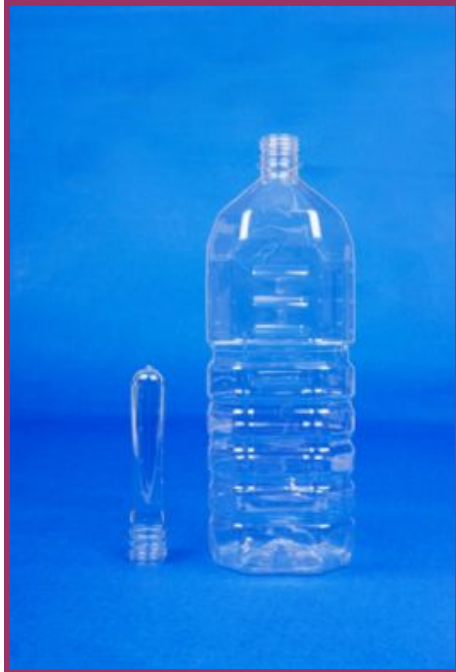
Product I: PET 28mm * 41g PCO1810