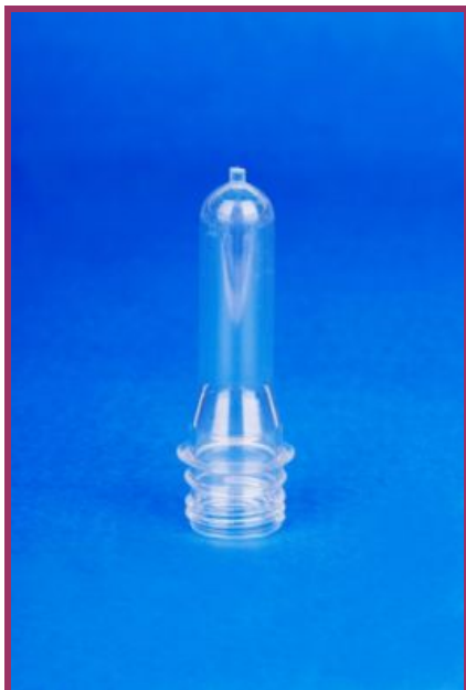
Product C: PET 28mm * 18g PCO1810