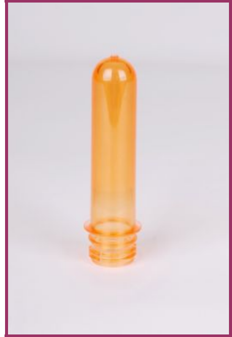
Product F: PET 28mm * 29g PCO1810