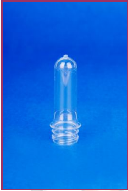
Product A: PET 28mm * 15g