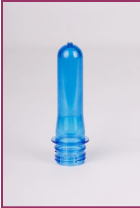
Product E: PET 28mm * 27g PCO1810