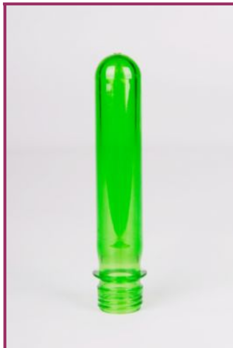
Product G: PET 28mm * 75g PCO1810