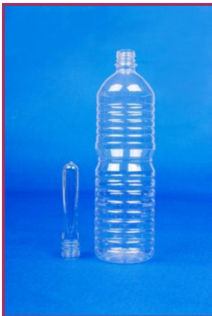
Product G: PET 28mm * 31g PCO1810