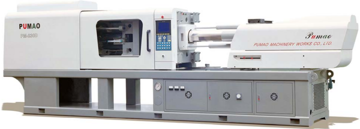
PET Injection Molding Machine