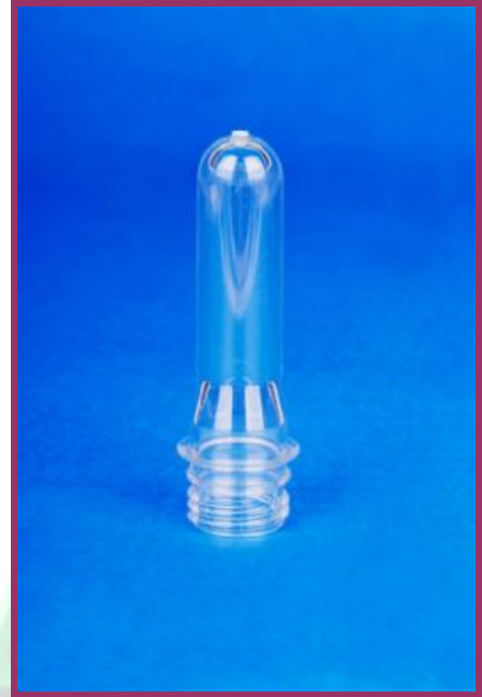
Product C: PET 28mm * 16.5g PCO1810